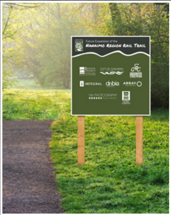
Sample temporary signage