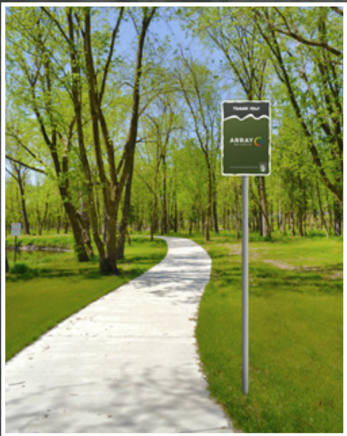
Sample recognition signage