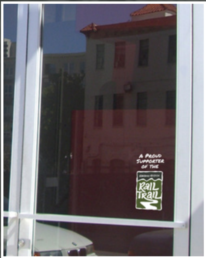
Sample window decal